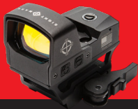
CORE SHOT A-SPEC LQD REFLEX SIGHT