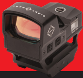
CORE SHOT A-SPEC FMS REFLEX SIGHT